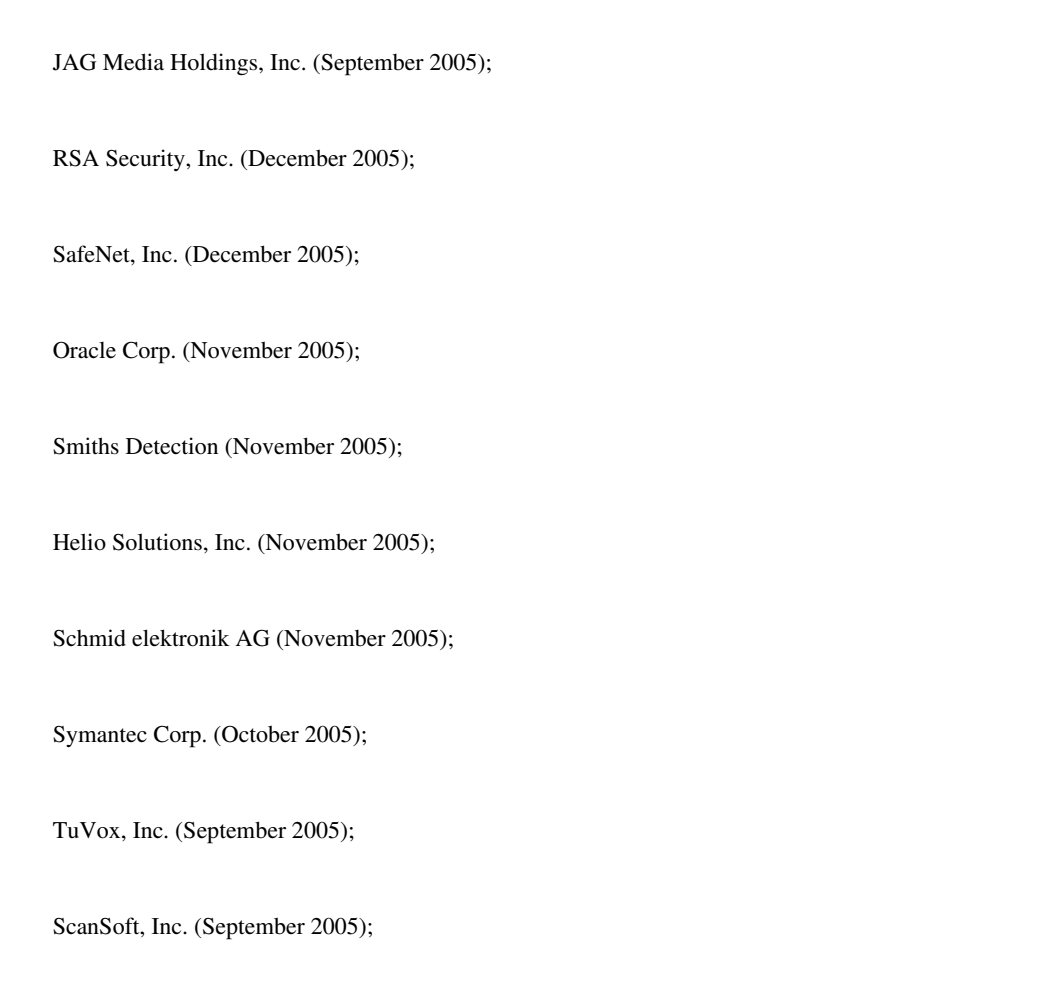
Table of Contents 169